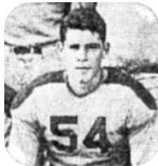
Ed Dalton End